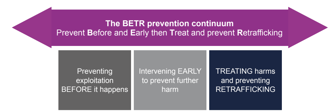
Figure shows the 'Before, Early, Treat and Preventing Re-trafficking' framework and its relations between prevention, intervention and treatment (Such et al., 2022: 8).