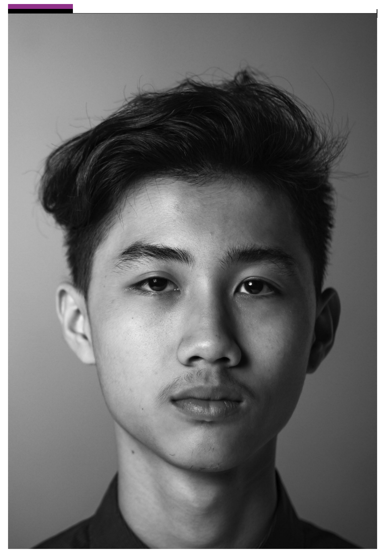
This image is a stock photo used for illustrative purposes only. No child victim is depicted in this report.