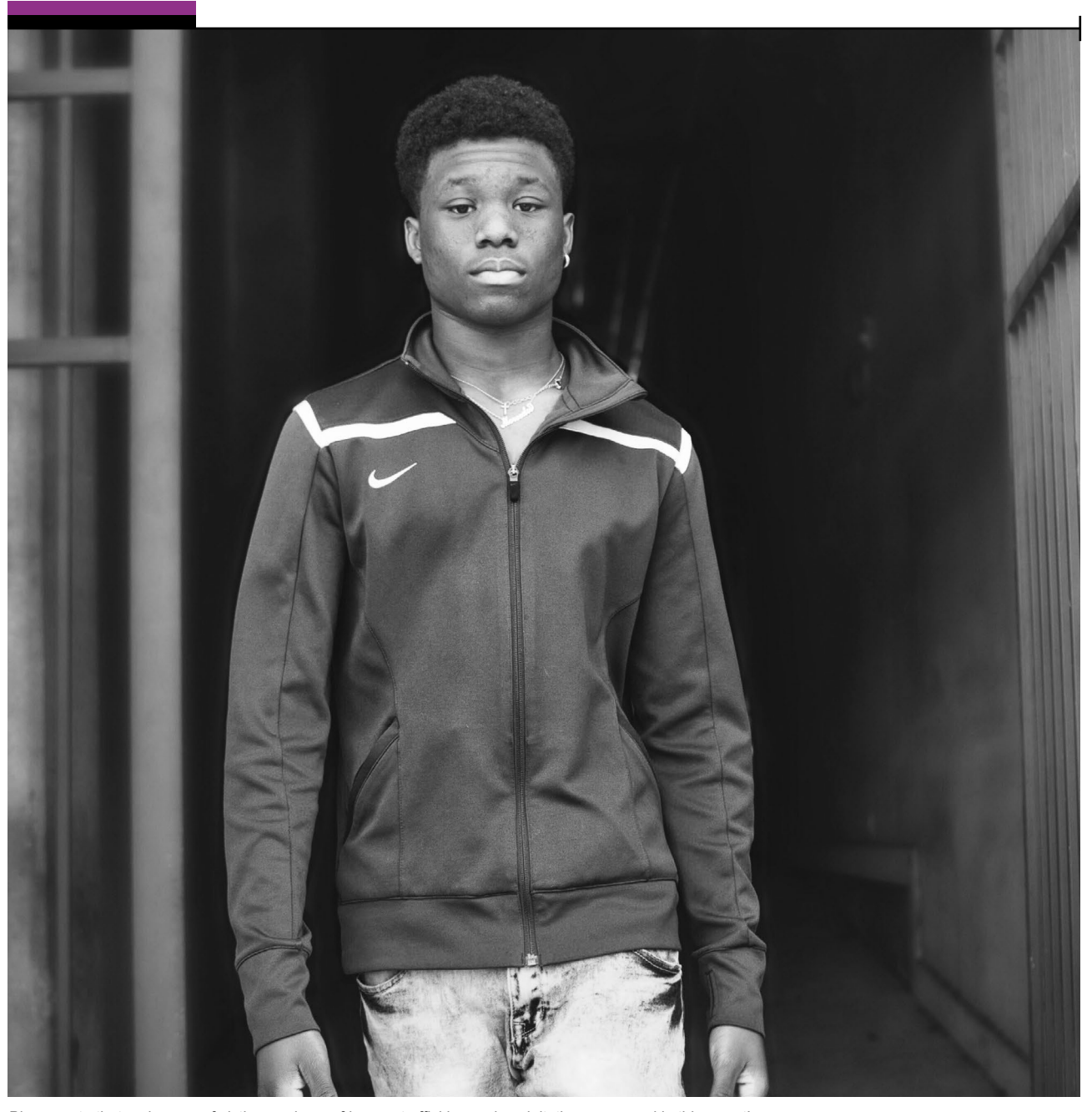
Please note that no images of victim-survivors of human trafficking and exploitation were used in this report

Unaccompanied children are some of the most vulnerable populations in the UK, with mounting political hostility demonising migrants and refugees. Growing structural challenges and pressure from local authorities resulted in the Home Office extending the use of hotels as accommodation to asylum-seeking children in the UK. Our report explores this practice through a storytelling approach that highlights the impacts of placing already vulnerable, unaccompanied asylum-seeking children inside Home Office hotels. Our legal analysis extends